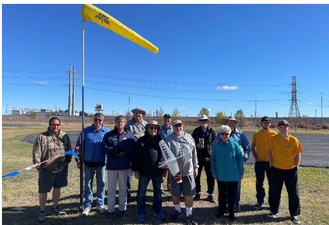
Contestants attending the Windy “Fall Finale” see text for details. Note the two Mayer Boy’s on the right in Tee Shirts unaffected by the cool weather. Oh to be young again!

The wind had actually picked up a little, so we agreed to forego the final, and the juniors agreed to postpone their Goodyear event until the next day.