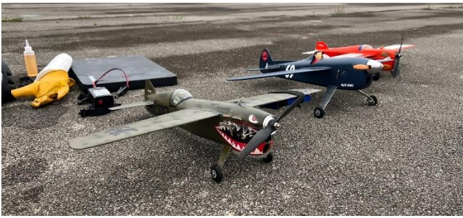
The "B" tr lineup for judging.

The only other event I entered was SGY, and my engine just wouldn't run for beans. No Idea what's going on with it, I'm still a bit mad at her! But, third in the bronze cup sounds better than ninth! All of the other racing happenings were a blast to watch, and maybe I'll get around to entering more classes next year.