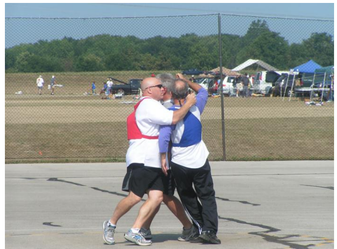
The battle for the center in F2C