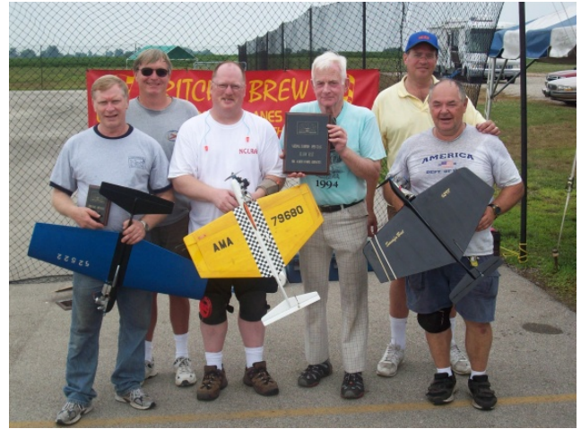
Slow Rat winners

Slow Rat is quickly becoming the 'Top Gun' event; just slightly more manageable than with the .36 motors.