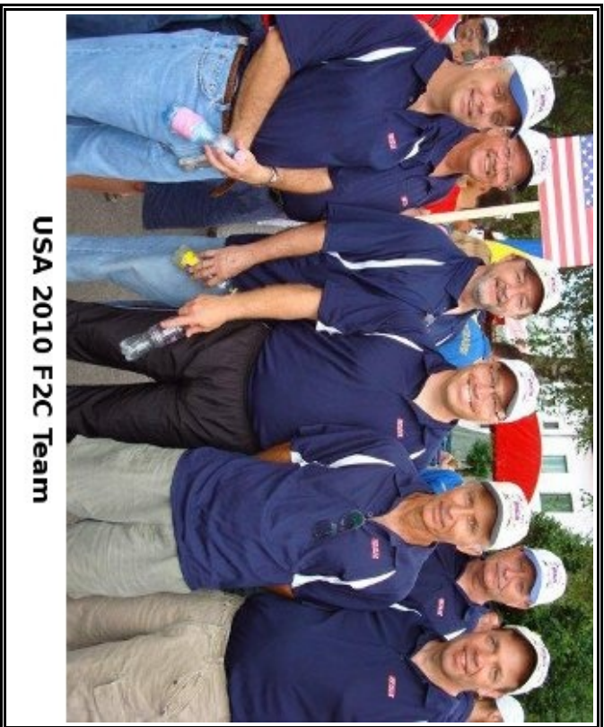
USA 2010 F2C Team