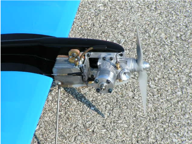
Les Akre's Clown Racer. O.S. 18tz with cooling fins turned down, replaceable mounting plate allows 3 different engines to be used.

event are getting faster and faster. A team from Florida was also using the O.S. 18tz engine and had airspeed and laps good enough for a 167 lap heat. Had they been able to finish the final, it would have made for a very good race.