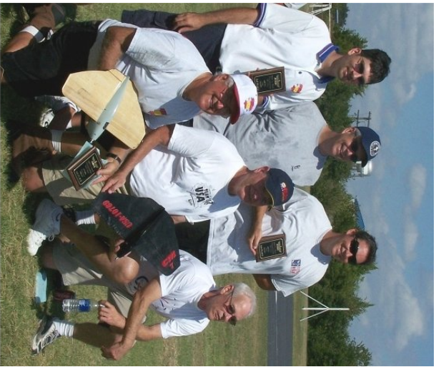
Torque Roll Issue #81 August, 2008