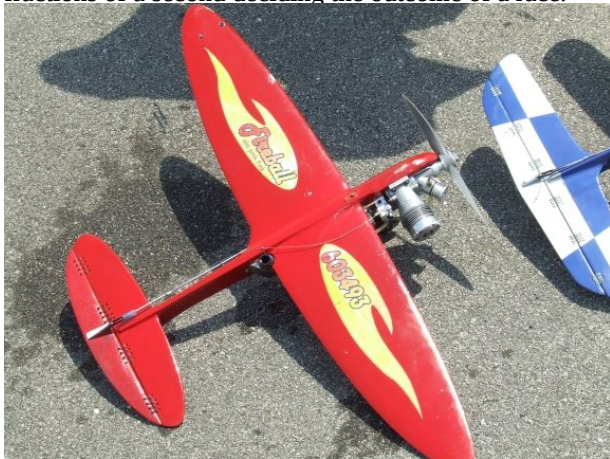
Steve Wilks' 'Pink Phink'

13 entries made TQR again the best attended event. The competition is very tight in this event with sometimes just fractions of a second deciding the outcome of a race.