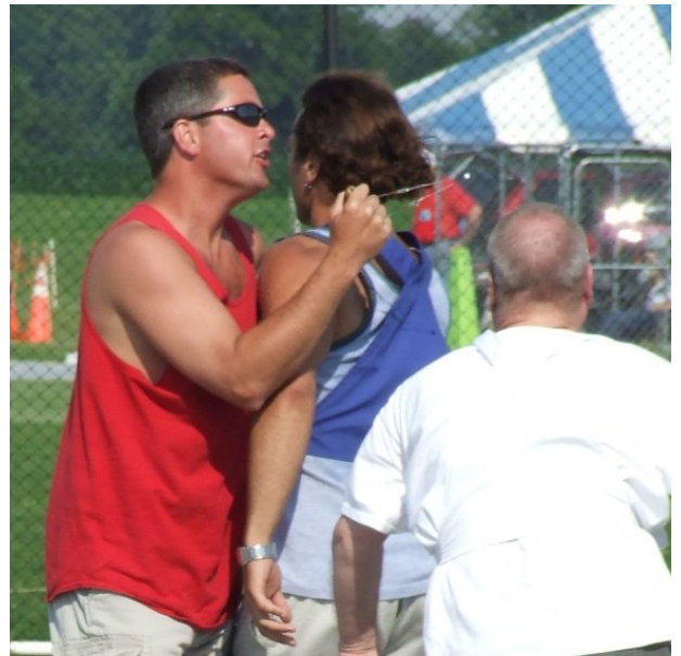
F2C final...moments before disaster